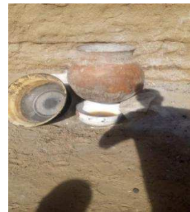
Figure 2. Filtering of Mineral Solution into the Collection Chamber After soaking with water.

another clean pots/containers without perforation but of the same sizes with the perforated ones or supported with stones if the perforated are bigger than the intact containers. Water is sprinkled on the ashes gently and gradually until it is fully soaked and submerged. More water is added gradually and continually until the containers are filled. The system is allowed to stay overnight and the concentrated mineral solution filtered or leached down slowly into the clean pots/containers serving as collection chambers. The concentrated mineral solution is then boiled while constantly adding ashes and stirring with a long cooking spoon for six to eight hours. The solution then forms paste like product, as the water evaporates leaving only the solid mineral licks. The product is then molded into blocks using small plastic containers polished with groundnut oil to prevent the mineral blocks sticking in them and to ease removal of blocks after sun-drying for 2 days. The process takes 2 to 3 days to complete the production cycle as shown in in Figures 1, 2 and 3.