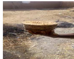
Figure 3. Molded and Sun-Dried Local Salt Block.