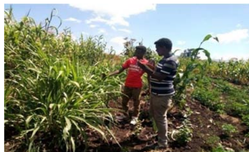
Figure 3. Experimental farmers evaluate Napier grass leaf roughness and hairiness on the far.

among the tested cultivars. The most bottom roughness was recorded from cultivar ILRI #*16798 whereas the sparse roughness was recorded from cultivar ILRI #*16800.