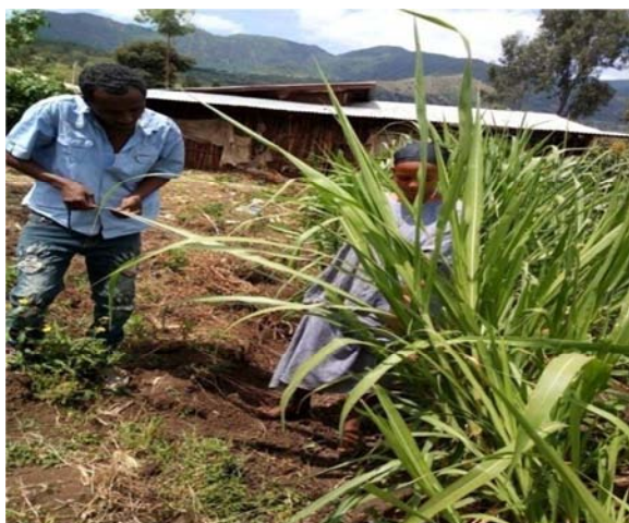
Figure 2. While measuring leaf width (left side) and measuring leaf length (right side).

There was no significance ( P > 0.05 ) difference in sheath hair that most cultivars have sparse hair similar findings with [28] who reported that most species had sparse sheath hair and also most of the cultivars had a green leaf. Top leaf roughness has significance ( P < 0.001 ) difference. The most top leaf roughness was recorded from cultivar ILRI #*16798 followed by ILRI #*16801 whereas sparse hair was recorded from ILRI #*16800, ILRI #*16840 and local. There was also a significance ( P < 0.01 ) difference bottom hair leafiness