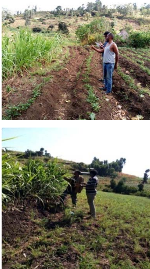
Figure 4. Experimental Farmers selecting Napier grass cultivars based on uses for animal feed and soil bund stabilizing.

A comparison of the survival and plot cover or vigorcity of five Napier grass cultivars along soil bund was shown in (Table 4). Farmers and development agents (DA) were evaluated Napier grass cultivars according to their criteria's of survival and plot cover. They ranked firstly cultivars ILRI #*16800 and local; secondly cultivars ILRI #*16840 and ILRI #*16801 in terms of survival and plot cover and the least score for ILRI #*16798 was given. Farmers strongly believed that plot cover is the most criteria for giving a high yield of biomass yield.