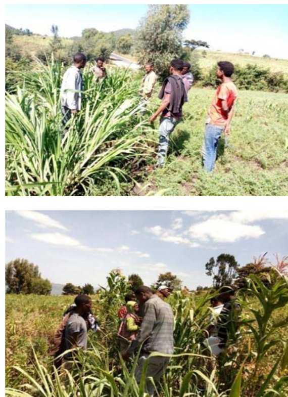
Figure 5. Key selected Farmers evaluating Napier grass cultivars as used for animal feed and soil bund stabilizing.

The farmers choice Napier grass along the soil bund rather than planting it alone due to land shortage as [14] reported mean land holding size per household of Gemechis district is 0.39ha and 0.5ha for Chiro as reported by [21] that is below national average land holding size per household which accounts 1.14ha in 2014/15 [7] and 1.14ha for the Oromia region. The farmers agreed that Napier grass has advantage soil bund stabilizing similar with [42] who reported that suitable stabilizers, grasses or shrubs, are needed to compensate the yield losses caused by the construction of soil bunds and re-enforce the structures. [17] findings also revealed that grasses can be used as animal feed, stabilize physical measures to reduce maintenance cost and reduce soil erosion. The same findings reported by [27] forages used by smallholder farmers in the soil conservation of northwestern Ethiopia were Napier grass ( Pennisetum purpureum ) have the potential to minimize rates of erosion, keep clay materials in its original place, and capture eroded clay materials [31].